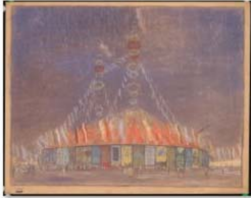
Exhibition grounds, Berlin-Charlottenburg Broadcast pavilion or exhibition tent Perspective view Ca. 1927-31 Chalk pastel on cardboard 101,7 x 129,2 cm

Tchoban Foundation Museum for Architectural Drawing