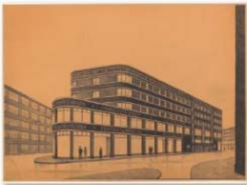
New design for the Bülow Square area ( Scheunenviertel ), Mitte, Berlin Babylon Cinema and housing Perspective view Ca. 1927-29 Charcoal on tracing paper 70,3 x 95,5 cm