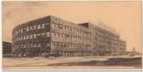
Haus des Rundfunks , Charlottenburg, Berlin Perspective view of Masurenallee Ca. 1928/29 Charcoal on tracing paper 72,7 x 147,9 cm

Tchoban Foundation Museum for Architectural Drawing