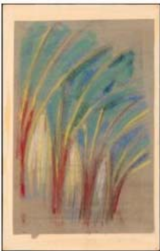
Interior study Perspective Undated Chalk pastel and pencil on paper on cardboard 58,1 x 37,4 cm