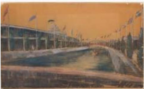
Exhibition grounds, Berlin-Charlottenburg Conference centre and the main restaurant Perspective view ca. 1927-31 Chalk pastel on cardboard 64,4 x 105,8 cm