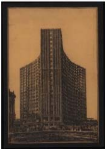
High-rise building at the railway station Friedrichstrasse, Berlin-Mitte Perspective view 1921 Charcoal on tracing paper 109,9 x 77,5 cm